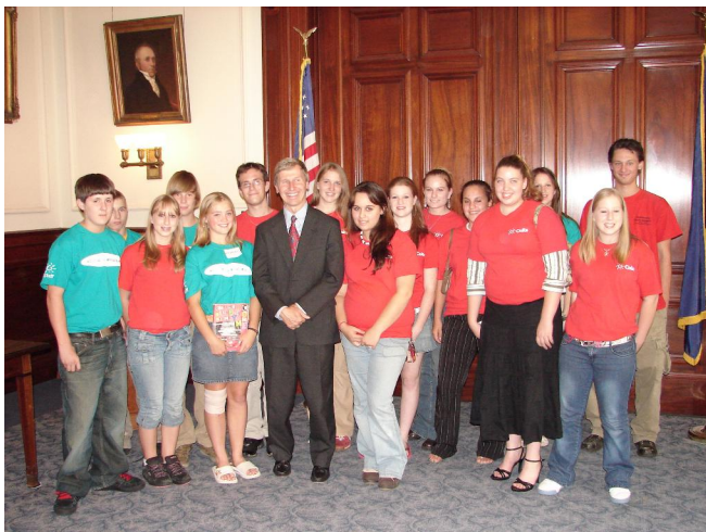
Governor Lynch poses in his chambers with the Community YouthMapper Group on Friday, September 23, 2005.