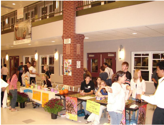
Parents and students mingle at the Open House on October 6, 2005.

Thank you to everyone who attended the Open House on October 6, 2005. It was wonderful to see so many parents and students attend this event. We will be having another parent night during the second semester. More information will be forthcoming.