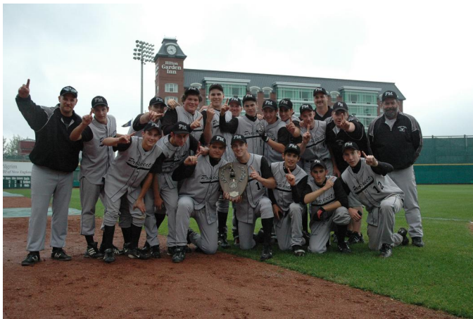
2007 PMHS Timber Wolves Baseball Team after they take the Class M Championship Title on Saturday, June 9, 2007.

Congratulations to the Boys Varsity Baseball Team – 2007 Class M Champions!!! The boys defeated third ranked Franklin at Merchantsauto.com Stadium on Saturday June 9, 2007.